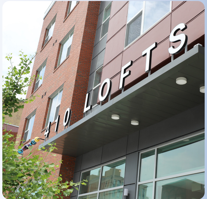
Four Ten Lofts is now open in Downtown's Bromo Arts District

Byrnes & Associates has nabbed 21 new leases in the historic Vickers and Redwood Exchange buildings in the last 7 months. DPOB Clean and Capital Projects teams have been working hard to keep the area clean, safe, and welcoming for these new tenants.