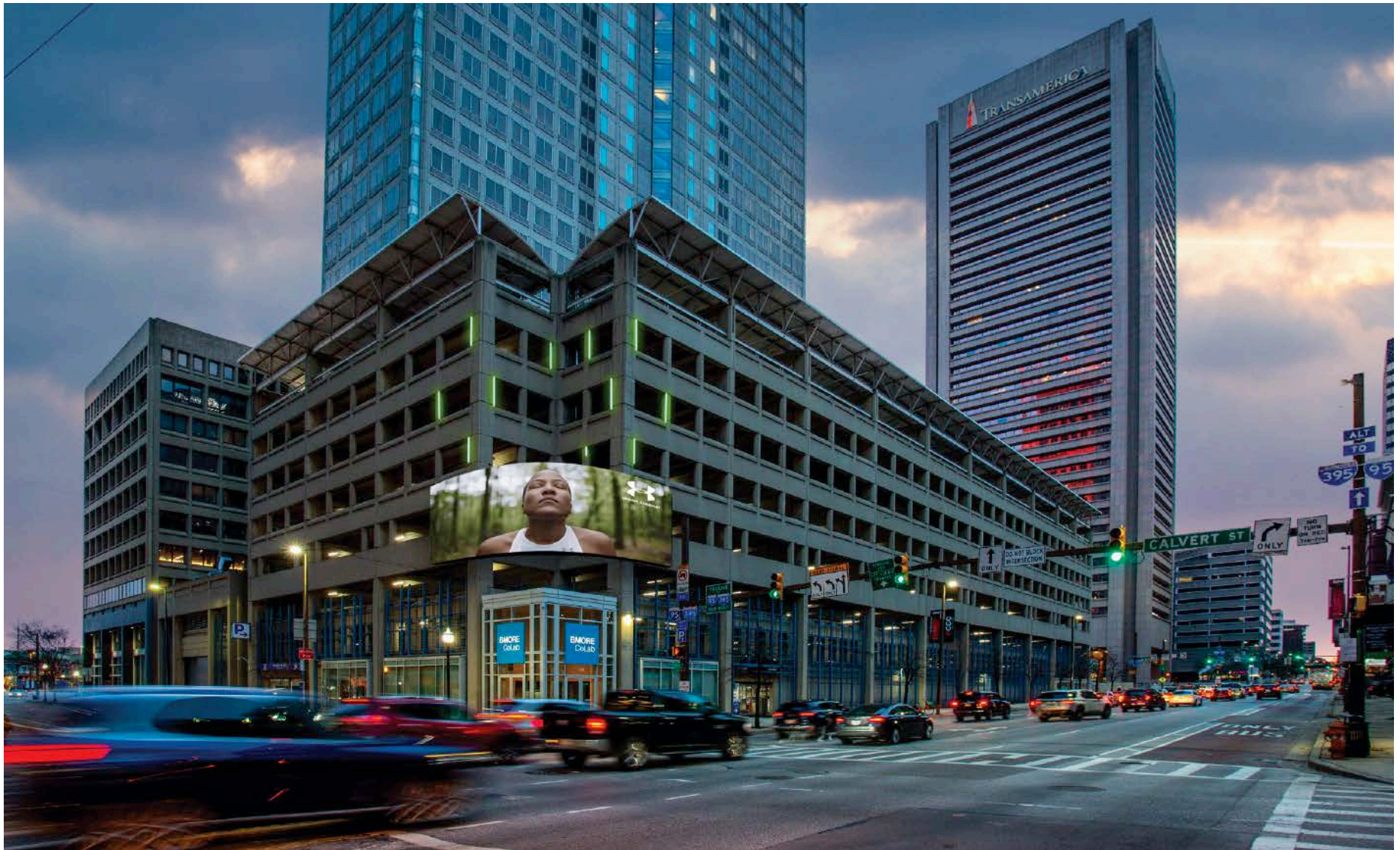
100 E Pratt Street Northeast Corner