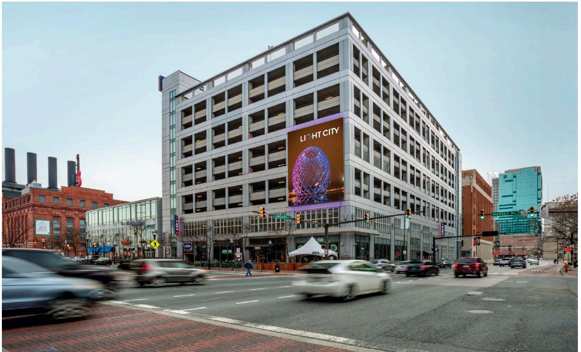
124 Market Place East Facade