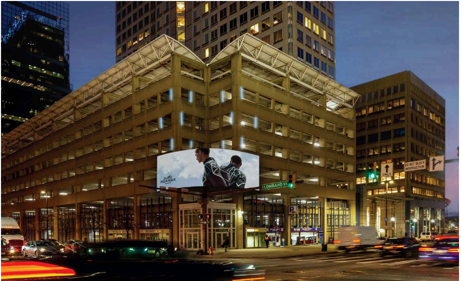
100 E Pratt Street Northwest Corner