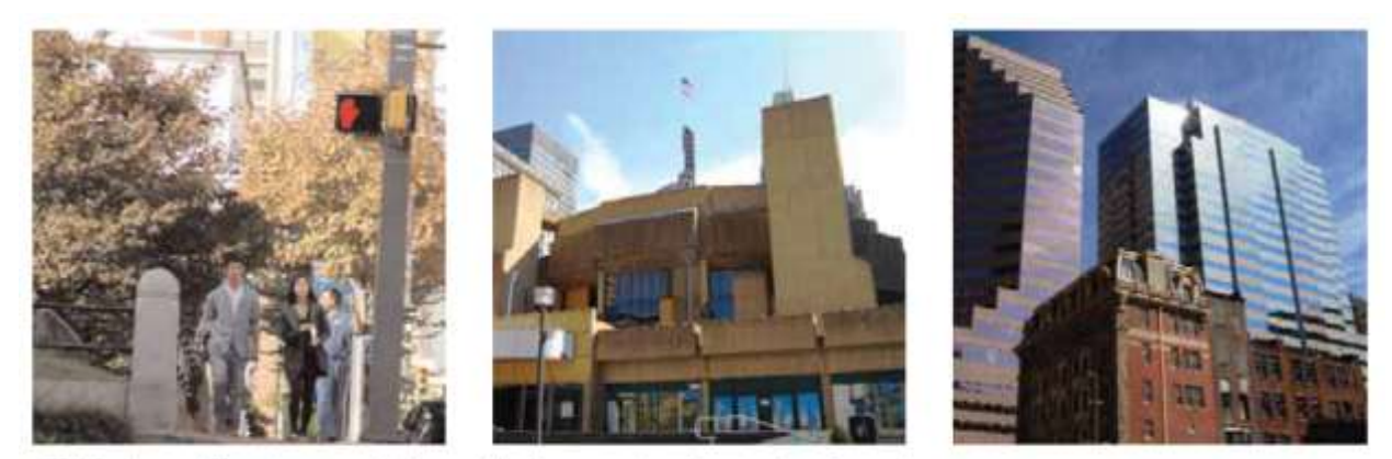
PHOTOS: Areas of Downtown are thriving while others are struggling to attract tenants

Aside from this new popularity, Downtown was already the single most important economic resource for Baltimore City in terms of jobs, tax base, and residential density. An earlier report, Downtown Baltimore: Its Impact on the City Economy , released by Downtown Partnership of Baltimore in the Fall of 2010, showed that Downtown Baltimore is just 3.8% of Baltimore's total area but contains 17% all Baltimore businesses and 27% of all jobs. It also provides $17 billion in direct economic output which is nearly 30% of the Baltimore City total.